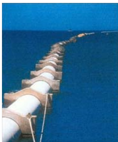
Pipeline Near Keahole Point, Kona Hawaii that brings us Kona Minerals