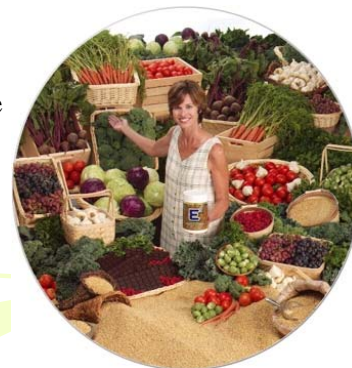
E7 gives us more than 40 servings of vegetables in a delicious shake.

The reason that Risotriene E7, Collastin, Liver Boost, Aloe 7000, etc. are the right products to promote in our business is because they provide tremendous noticeable benefits addressing the roots of illness for all major common health concerns and the benefits never stop. Readily assimilable concentrated food is the best first answer to improve and maintain anyone's and everyone's health on all levels. 80% of surveyed adult population are looking for better health. Of this population a good number will be receptive to a real solution that tastes just fine! The results make the products indispensable, meaningful and fulfilling for all involved. So what will it be? Chocolate?